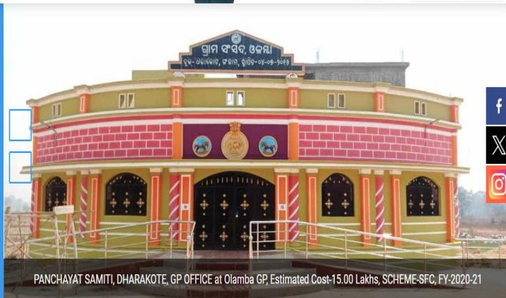
PANCHAYAT SAMITI, DHARAKOTE, GP OFFICE at Olamba GP, Estimated Cost-15.00 Lakhs, SCHEME-SFC, FY-2020-21

The Panchayati Raj Project Management System (PPMS) is a web-based portal that effectively manages and oversees the creation, approval, and execution of projects. It helps PRIs to create case records, estimate costs, and generate work bills. The software streamlines the entire process of asset creation, ensuring a smooth and efficient workflow from its inception to its completion. With its various modules, PPMS simplifies the process, resulting in greater customer satisfaction.