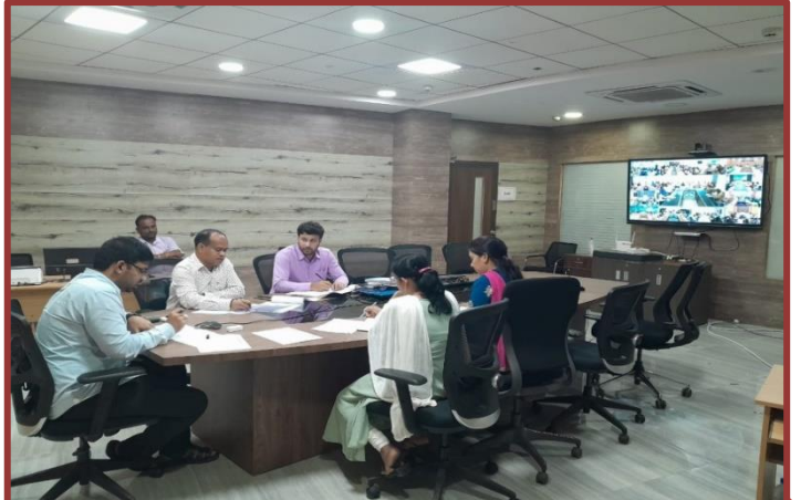
CDO-cum-EO, Ganjam taking review of all BDOs, AEEs and APOs through OSWAN VC during Sept, 2023.