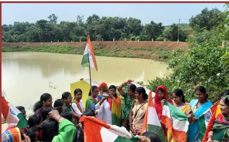
Celebration of Independence Day, 2023, plantation (Amrit Vatika), collection of Maati for MMMD programme held at Amrit Sarovar in Pandakamal village, M Rampur Block, Kalahandi District.