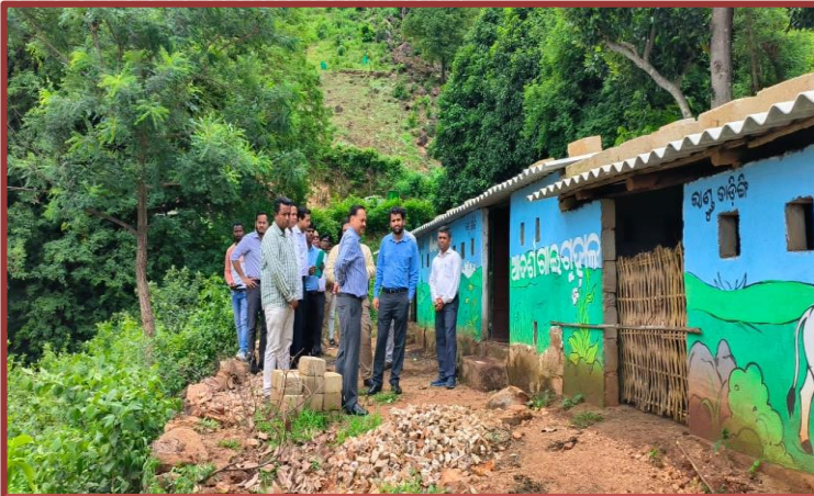
Field visit by Principal Secretary, PR & DW Dept and Director, Special Projects during July, 2023 (left) Cluster cow shed under MGNREGS, Kotiya GP, Pottangi Block, Koraput. (right) Interaction with farmers at Sunabeda GP, Umerkote Block, Nabarangpur