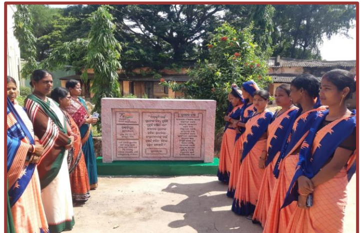
Installation of Silaphalakam having names of the Veers at Gandakipur School, Kujanga Block, Jagatsinghpur District.