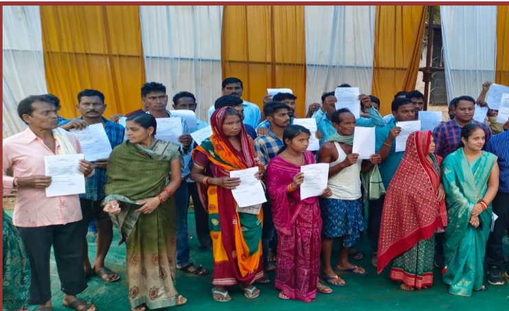
Distribution of work order for cattle sheds to the beneficiaries in Khaprakhhol Block, Bolangir during August 2023.