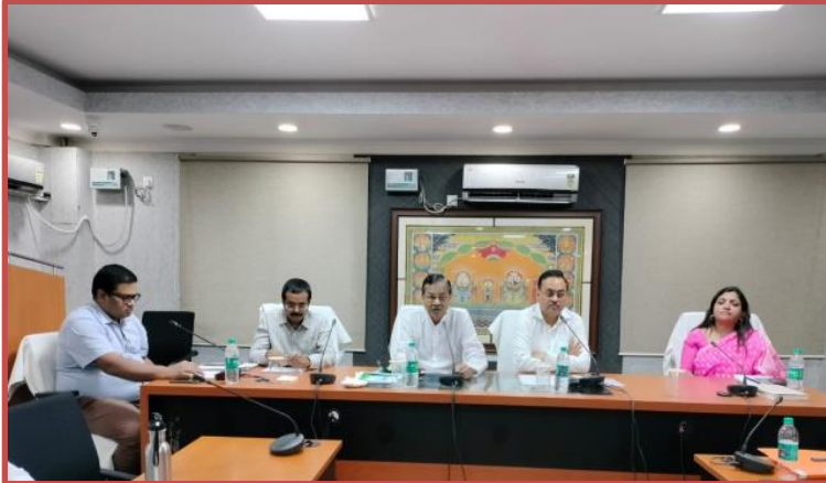
Two day CDO-cum-EOs conference held during 2 nd and 3 rd August, 2023. Hon'ble Minister, Panchayati Raj & Drinking Water graced the meeting at MGNREGS conference hall on 03.08.2023.