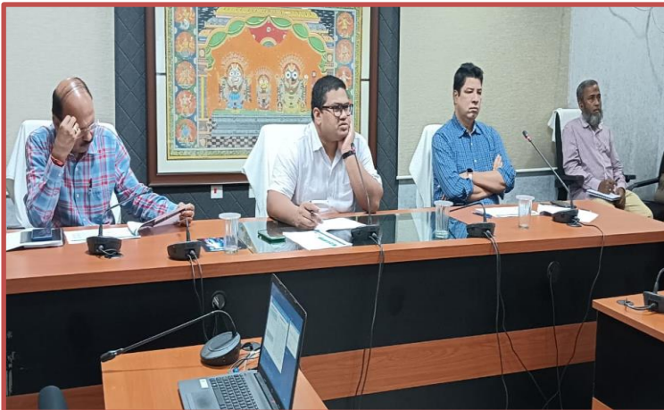
One Day review meeting of MCs & APOs of 20 migration Blocks was held under the chairmanship of Director, Special Projects on 20 th July, 2023 at SIRD Campus.